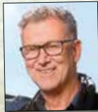
Peter Daicos All-time Collingwood Great