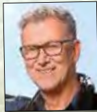
Peter Daicos All-time Collingwood Great